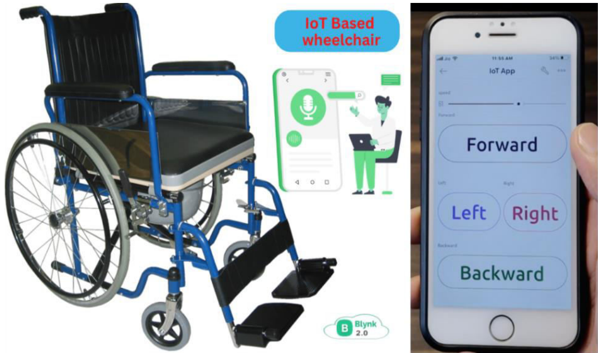
Fig. 2. IoT-enabled wheelchair with mobile app control

Wireless Communication Setup Bluetooth-Based Control: The majority of implementations employ a Bluetooth module (e.g., HC-05 or HC-06) to connect the mobile phone to the wheelchair. The application software transmits command characters (e.g., 'F' for forward, 'B' for backward), which are decoded by the microcontroller to turn motor drivers on.